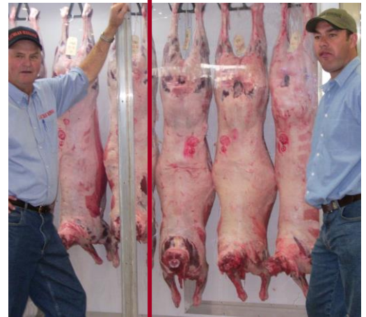
Other Competitors Lachlan Merinos entry 3 rd place: 20% lighter displaying extra body length